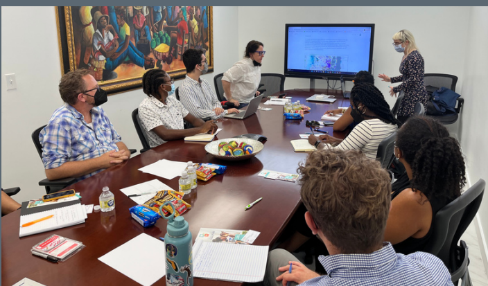
Community Engagement Workshop Sant La, August 2022

This year, the Miami Affordability Project (MAP) integrated the impacts of climate change with the newest iteration, the Climate and Equity Mapping Platform (CAMP) . This innovative suite of free accessible resources was co-designed to inform policymakers, developers, and other stakeholders of the impending impacts from extreme heat on Miami's underserved communities. SFCDC co-facilitated five community engagement workshops attended by more than 50 practitioners , both in-person and virtual, for feedback and input on the platforms design and utility before its launch in December.