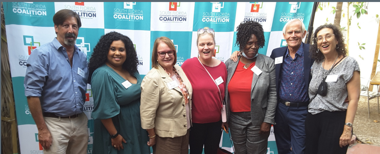
Coalition Networking Reception at Naomi's Restaurant, March 2022

South Florida Community Development Coalition, Inc. (SFCDC), established in 2007, is a 501c3 member-led organization dedicated to building communities and developing assets in South Florida. We achieve these goals by expanding the capacity of community development practitioners, facilitating public policy research and advocacy, and fostering collective impact for systems change . Our members include developers, nonprofits, financiers, practitioners, and advocates, among others who work to provide low-to-moderate income people with greater access to the tools necessary to build wealth and ensure all neighborhoods are livable, safe, and economically vibrant.