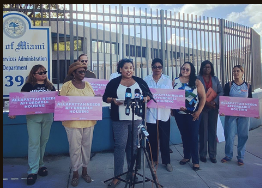
Local Media Press Conference Allapattah, September 2022

PLPG continued advocating on behalf of the proposed redevelopment of the General Service Administration (GSA) site, a nearly 18-acre lot of land owned by the City of Miami located in Allapattah. We held more than a dozen virtual and in-person meetings and interactions with elected officials and administrators to intervene on the Request for Proposals (RFP) process by offering criteria and advocated for a new resolution, including Community Benefits Agreement (CBA) requirements. These efforts remain on-going. The Working Group will work with Liberation in a Generation to refine the collective impact strategy and advocacy campaigns in 2023.