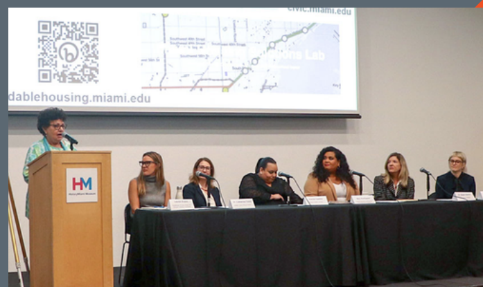
CAMP Launch Panel Discussion History Miami Museum, December 2022